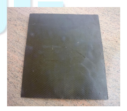
Fig 4: One layer composite

One layer carbon fibre and bisphenol resin