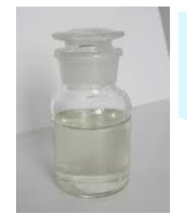
Fig 2: Bisphenol

BPA is employed to make certain plastics and epoxy resins. BPA-based plastic is clear and tough, and is made into a variety of common consumer goods, such as water bottles, sports equipment, CDs, and DVDs. Epoxy resins containing BPA are used to line water pipes, as coatings on the inside of many food and beverage cans and in making thermal paper such as that used in sales receipts.