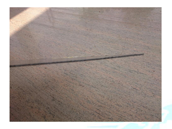
Fig 5: Four layer composite

IJREAT International Journal of Research in Engineering & Advanced Technology, Volume 3, Issue 2, April-May, 2015 ISSN: 2320 – 8791 (Impact Factor: 2.317) www.ijreat.org