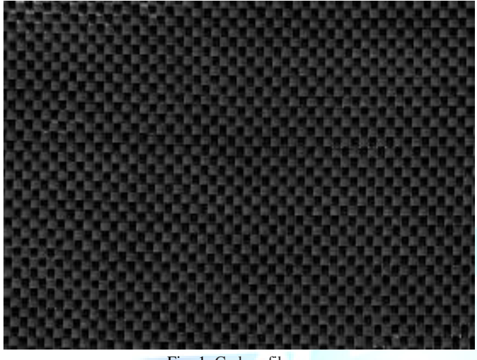
Fig. 1. Carbon fibre

IJREAT International Journal of Research in Engineering & Advanced Technology, Volume 3, Issue 2, April-May, 2015 ISSN: 2320 – 8791 (Impact Factor: 2.317) www.ijreat.org